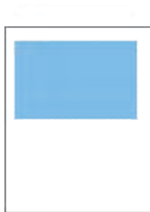
1/2 page horizontal