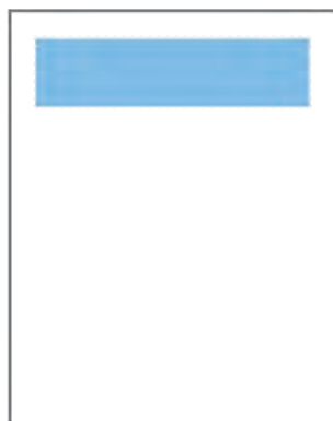
1/4 page horizontal

* the placement of the ad on the page may vary